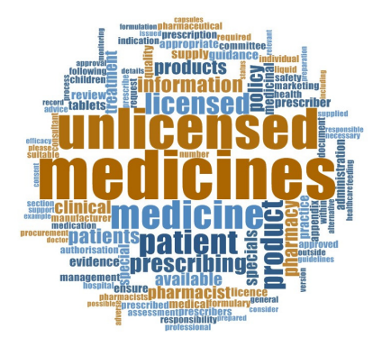
Figure 1: A word frequency cloud of the 1000 most commonly used words included in the guidelines

The quality of the guidelines was assessed using the AGREE II tool2. Content was evaluated by conducting a thematic analysis. The AGREE II tool rates the quality of the documentation across six domains and provides a score from 0% for very poor quality to 100% for excellent quality. Each guideline was independently assessed by two researchers.